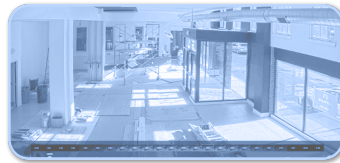
Continuous Video Recording