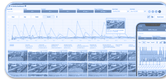
AI Media Dashboard