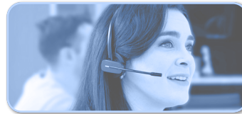
Full Service Support