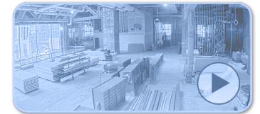
AI-Edited Time-Lapse Videos