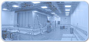
Live Streaming Video

Specification includes camera system and managed services