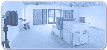
Installation and Maintenance