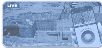
iOS and Android App